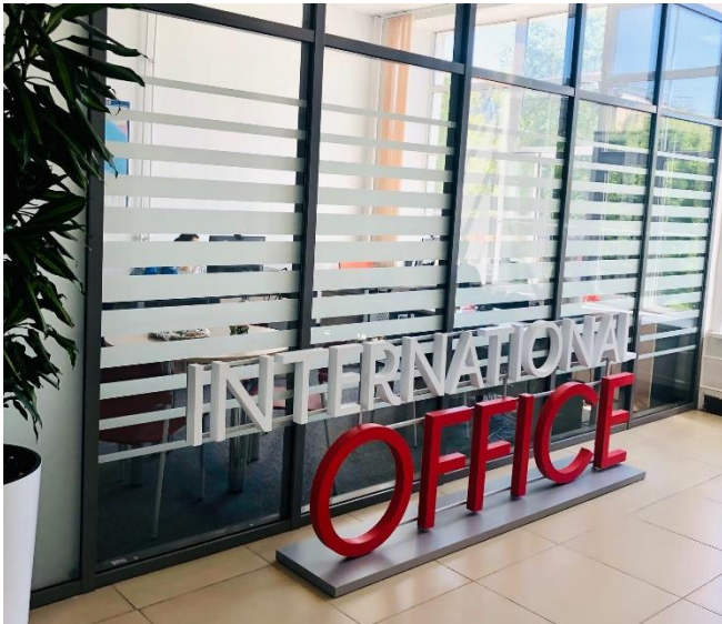
Picture: Project talks at HSE Int. Office, June 2021