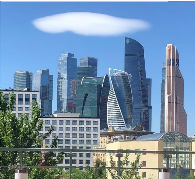
Picture: Global Smart Cities Project – Moscow Insights