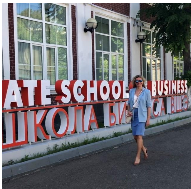
Picture: HSE campus visit by Prof. Ribberink in June 2021