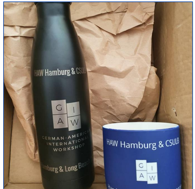
Awards for the winners of the "Best Business Idea" and "Best Presentation"