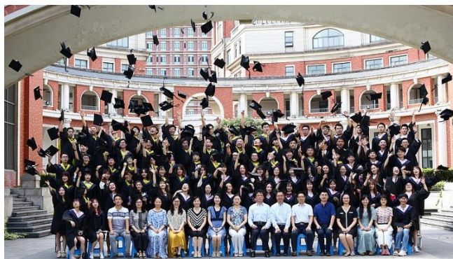
Graduates of the Shanghai-Hamburg College of the year 2020

Due to the outbreak of the COVID-19 pandemic, for the first time since the start of the cooperation between the HAW Hamburg and USST, the final oral defenses (colloquia) were held as live online sessions by professors from HAW Hamburg.