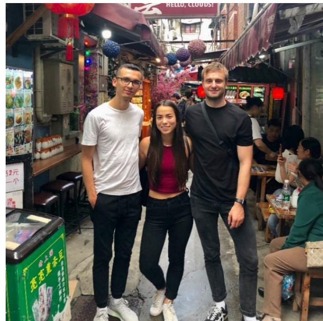
Exchange students from HAW Hamburg in Shanghai

In May 2020, the results of the benchmarking study were presented to the HAW working group responsible for the adoption of the new double degree master program, giving them valuable assistance for designing it.