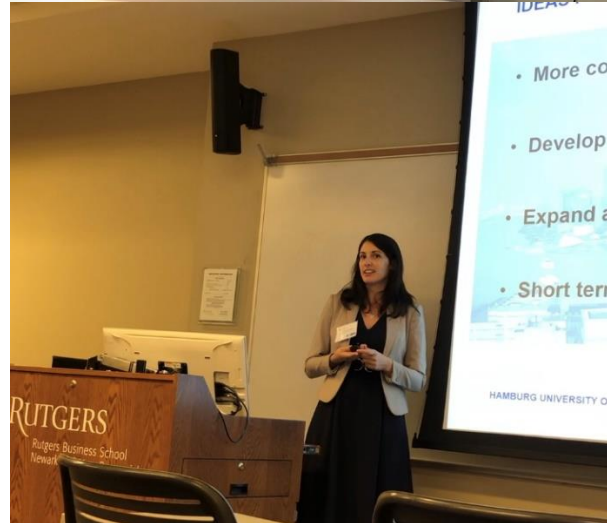
Academy of International Business US Northeast Regional Conference 2019 at Rutgers University in Newark, USA.