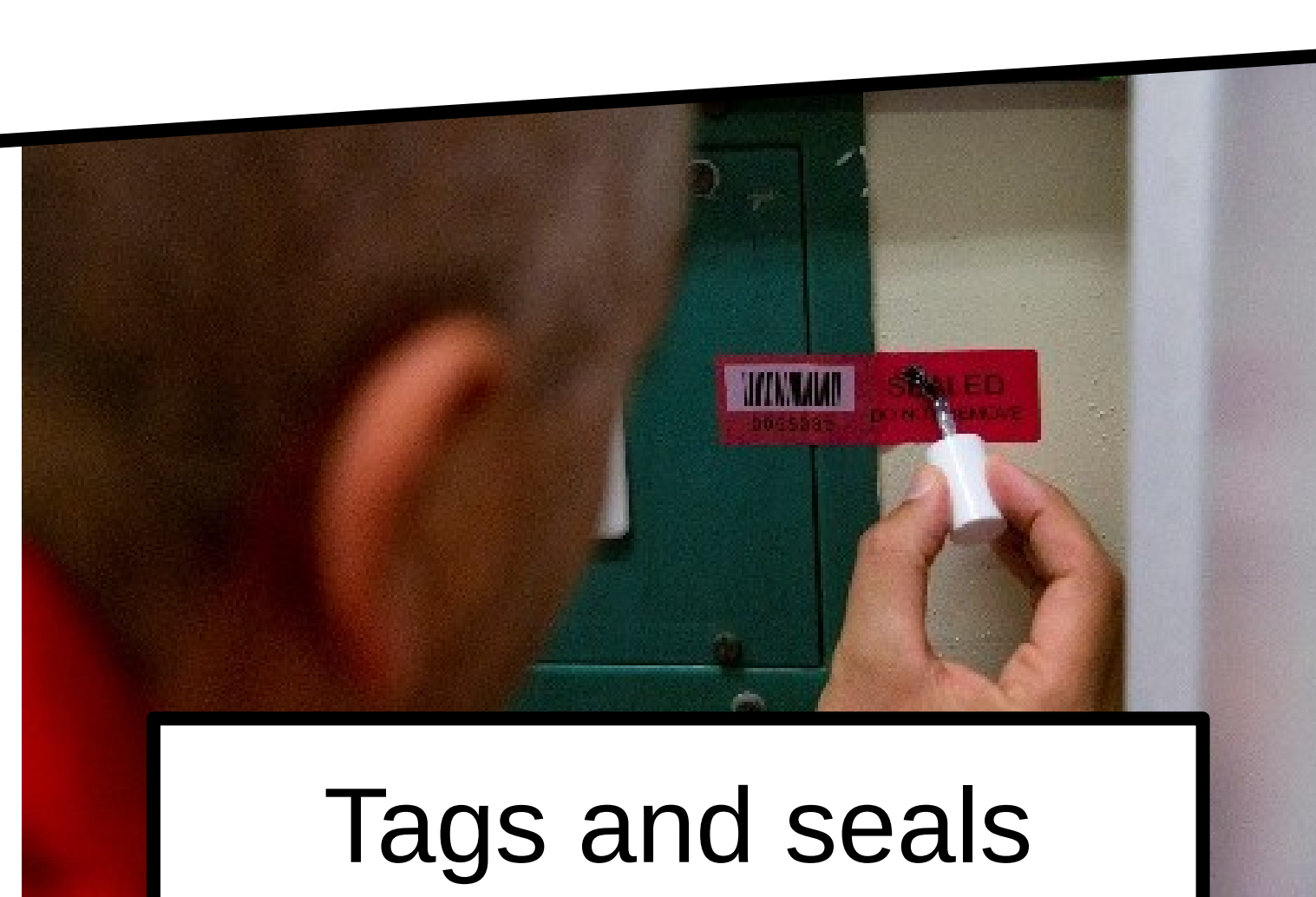
Tags and seals