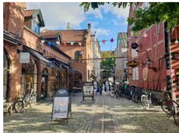
Figure 1: Odense is a cute city https://blog.dk-ferien.de/insidertipps-reiseberichte/odense/

If you want to finance your stay at SDU, you could consider to apply for the Danish “SU” a monthly allowance from the government to support students. It is free for Danish citizens. For internationals, Denmark offers that allowance program for working students. If you can find an employment with 15 hours / week, it is very likely that you can receive the students allowance. Double check the facts about that, but it might really be worth a thought.