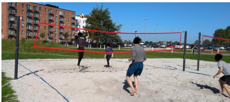
Figure 3: Volleyball court next to the university