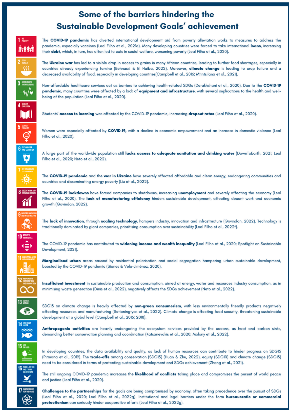
Fig. 4. Barriers opposing the Sustainable Development Goals' achievement.