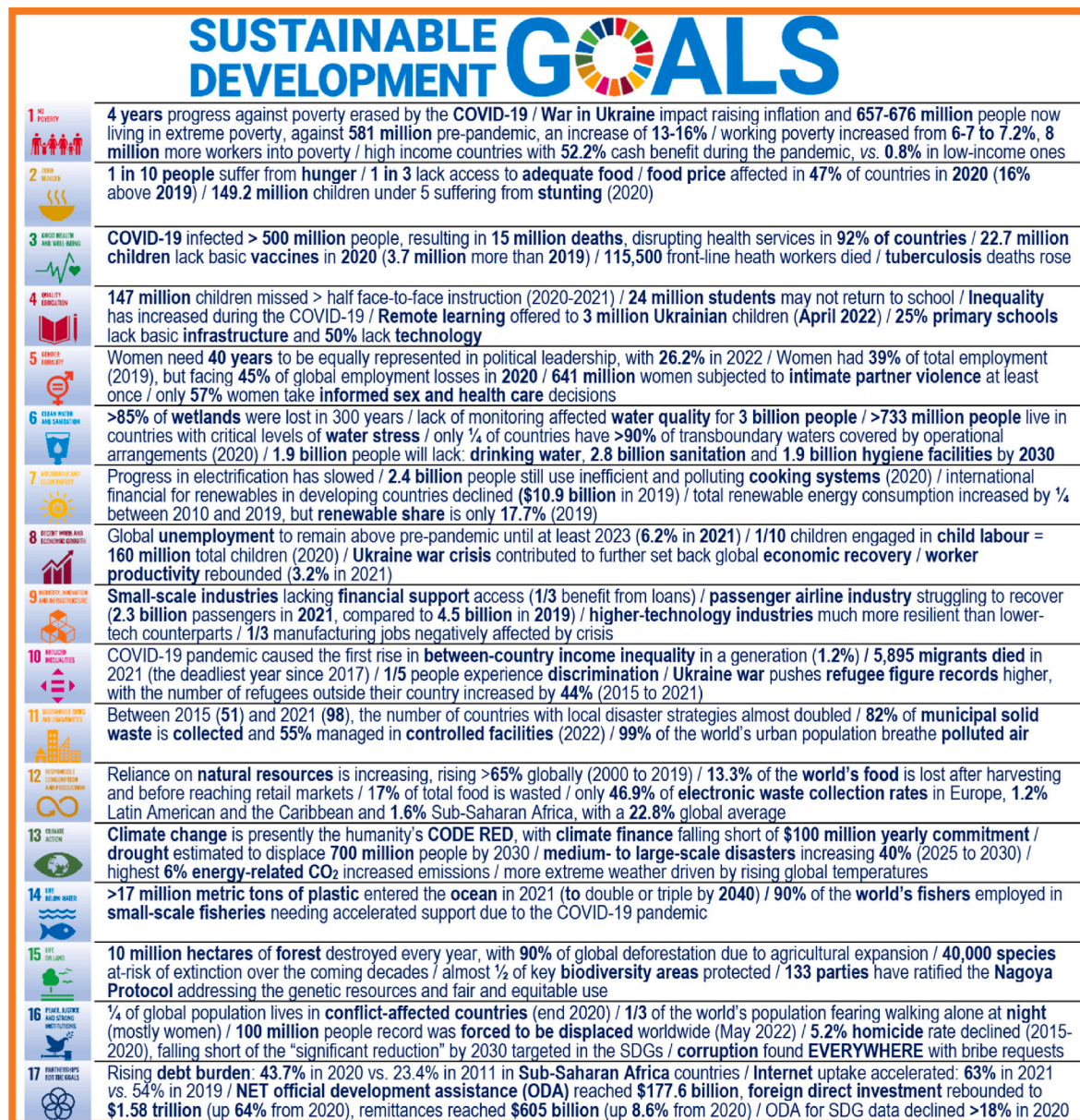
Fig. 2. Progress towards the Sustainable Development Goals' achievement, according to the latest UN data.

satisfactory. Despite the advancements generated within the MDGs' framework, and the subsequent contribution of the 2030 Agenda to promote sustainability debates and awareness, recent events such as the COVID-19 pandemic and the war in Ukraine led to serious concerns about the probability of fully achieving the SDGs by 2030. As previously mentioned, the reasons for these concerns vary between developed and developing countries. However, according to Lopatkova (2021), while Europe leads the SDGs globally, none of its countries are on track for the SDGs' achievement. Moreover, the global SDG index shows that even the wealthiest European countries are facing difficulties in meeting their commitments to SDGs. Berg (2019) claimed that the main barrier to that is not related to a lack of data, information, and knowledge; instead, it refers to human behaviour, intentionality, preferences, values, and worldviews. In order to address the literature concerns about the topic, a keywords' co-occurrence analysis on relevant studies was carried out, followed by cluster analysis (Fig. 3).