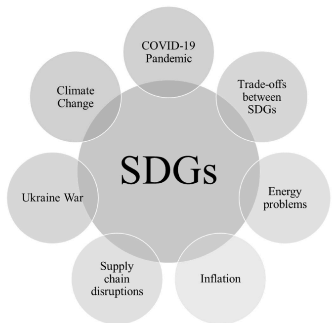
Fig. 1. Some of the factors interfering with the SDGs.

Another goal that has been largely discussed given the pandemic is