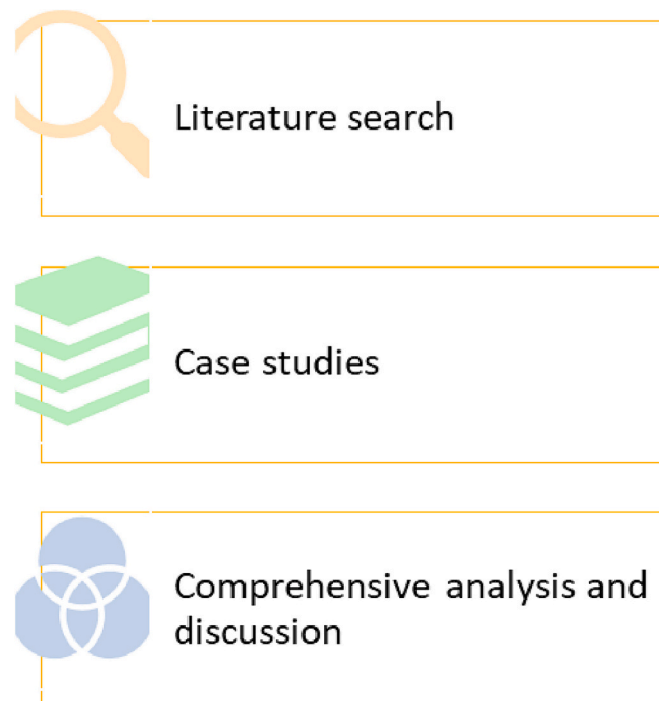
Fig. 1. Phases in the research.

The case studies provide a deeper insight into how AI is being used to implement SDG 11. By examining the common themes and results across these studies, it is possible to understand the evolution of AI technologies in cities and communities globally. The description of the study cases was divided into four categories: AI and Transport Planning, AI in Traffic Management, AI in Smart Energy Systems, and AI in Urban Planning. These categories were based on SDG 11 targets, described in Table 1. Insights garnered from the literature and case studies provide an assessment of potential AI applications to support the implementation of SDG 11. This study examined how AI-powered systems can analyse data, optimize resource management, improve urban planning,