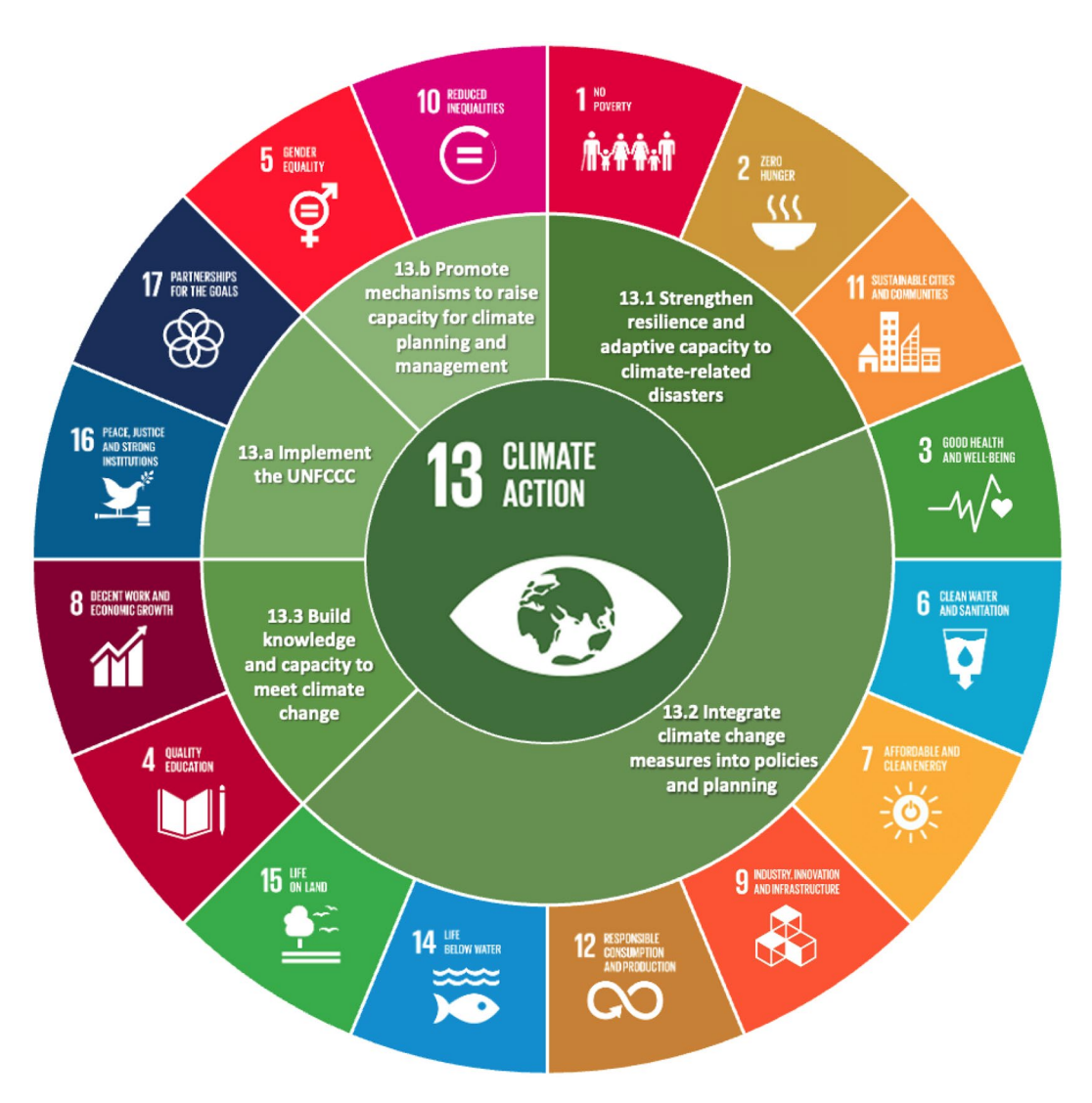
Figure 1. Relation among targets of Climate Action and the SDGs.

The targets related to the means of implementation (13.a and 13.b) rely on strong institutions and international partnerships (SDGs 16 and 17) for a mobilization of the resources associated with the UNFCCC, and highlight the importance of mechanisms to support climate change planning and management, hence contributing to SDGs 5 and 10^{19,23} .