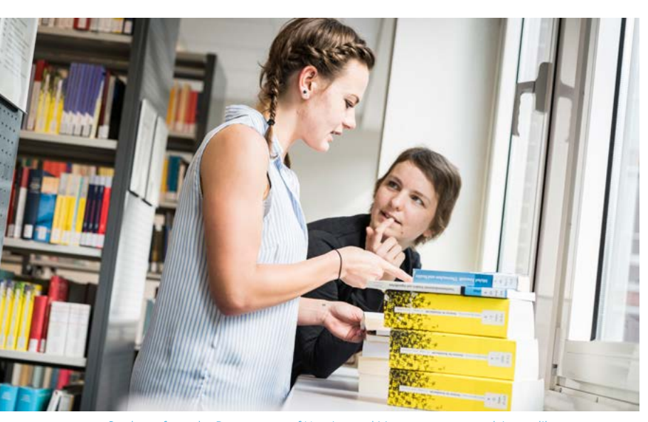
Students from the Department of Nursing and Management at work in our library

Our academic staff are committed to advancing knowledge to generate change in the healthcare field, across their research and teaching. The professors, staff and visiting lecturers, and researchers who work in the Department have strong and diverse track records in academia and professional practice, sharing their skills and experience in fields including research, business and management. Their passion for what they do permeates their teaching and research activities and they value each student as the individuals they are.