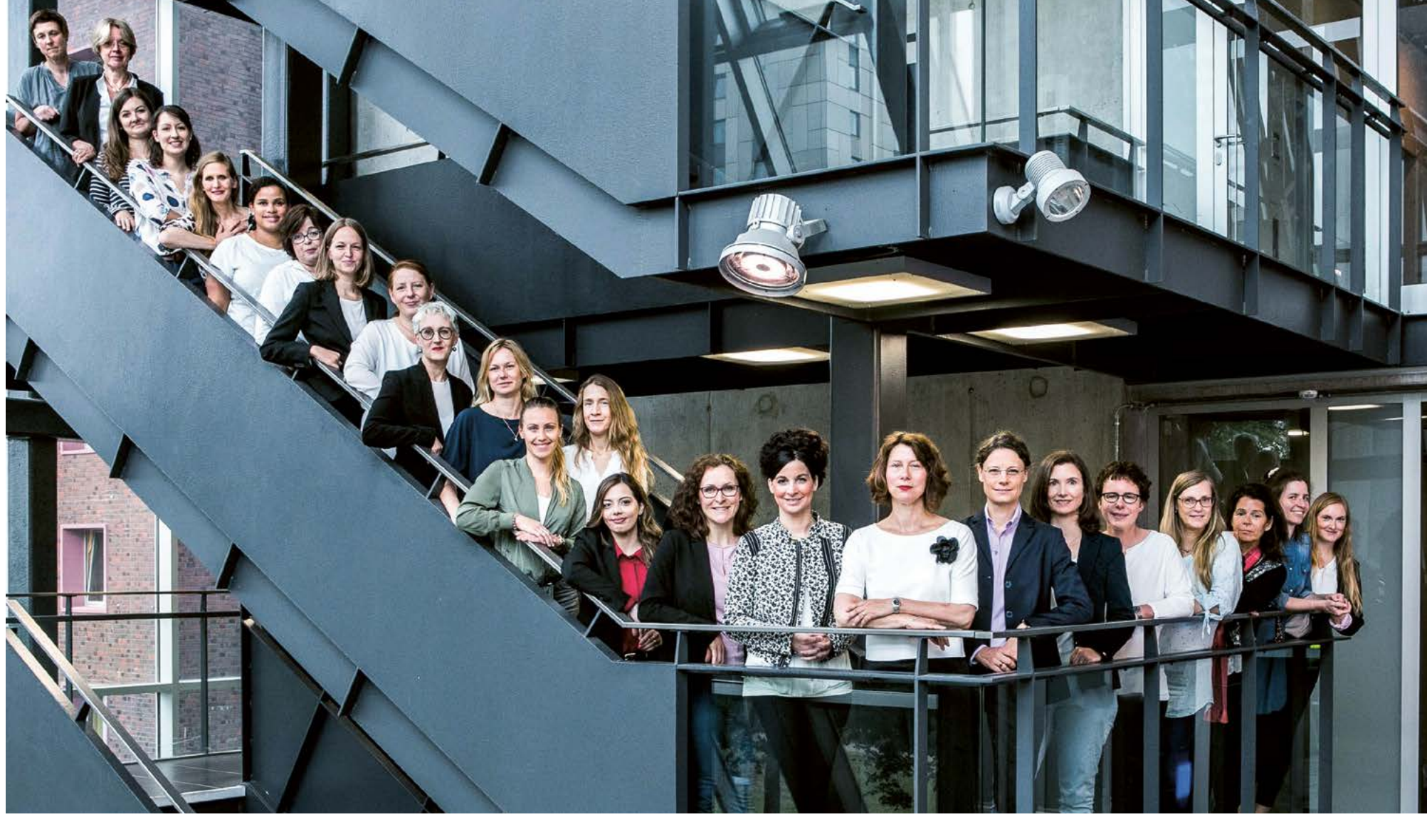
The staff of the Department of Nursing and Management, HAW Hamburg

Our courses work on the basis of small-group teaching, so we can give students a high level of individual attention. Students either complete a practical component alongside their theoretical studies or they come to us from a background of professional practice and learn academic methods and ways of working, which help them, for example, to identify needs for research from within their professional settings and launch projects to meet them. We make sure our students leave us with a sound grasp of the healthcare system, its workings and pathways to influencing health policy. In some of our courses, students specifically attain leadership and management skills that can enable them to take their careers – in whichever field they are located – to the next level.