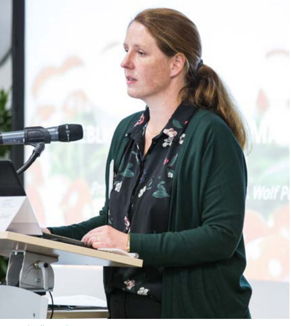
Experts in discussion