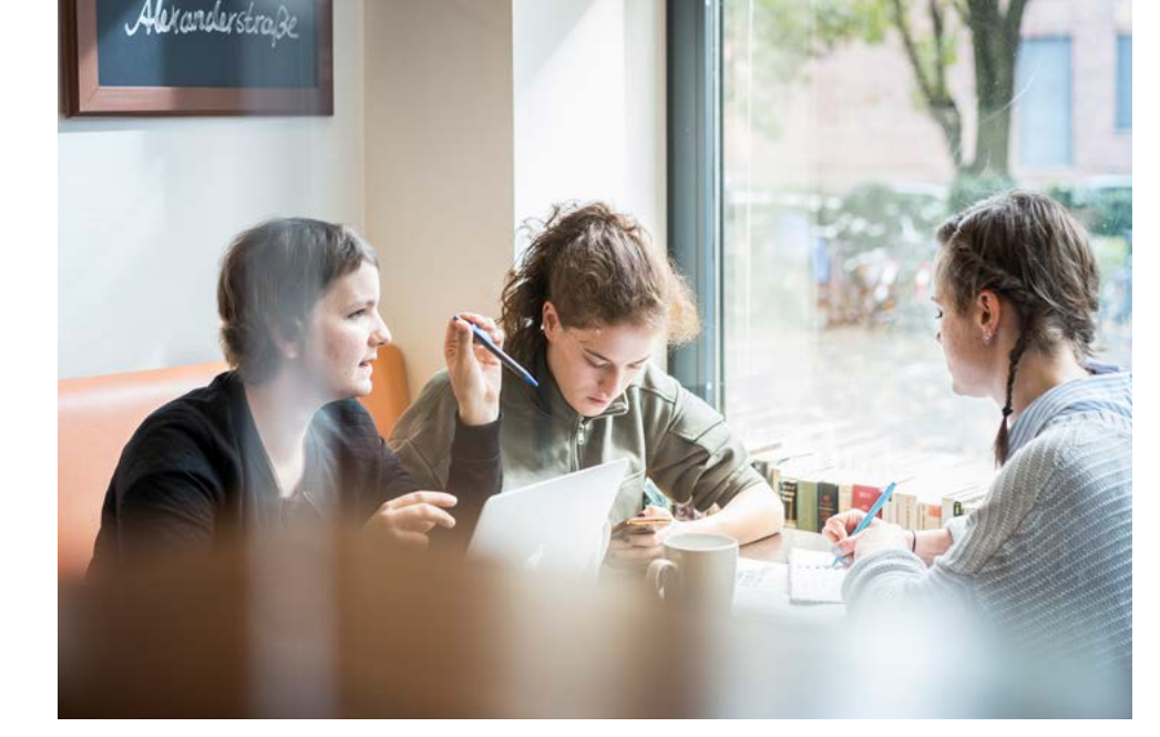
Share ideas and support over a coffee in our campus café