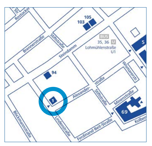
Via public transport: U/S Berliner Tor, U Lohmühlenstraße