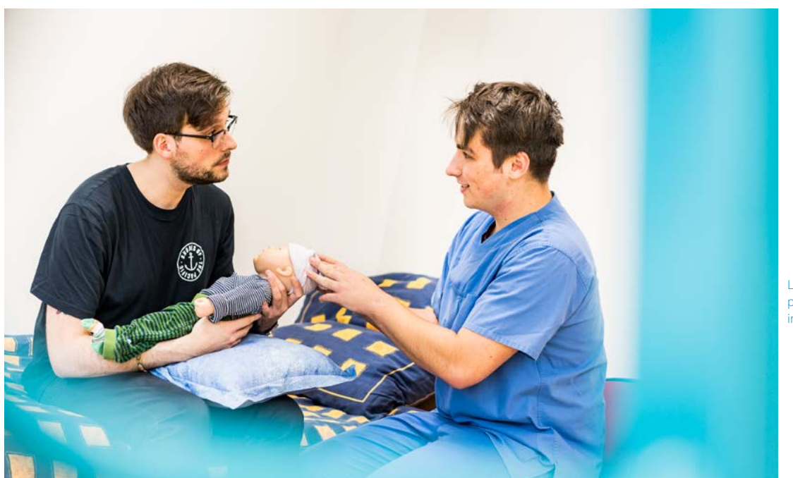
Learning for professional practice: students at work in our Skills Lab