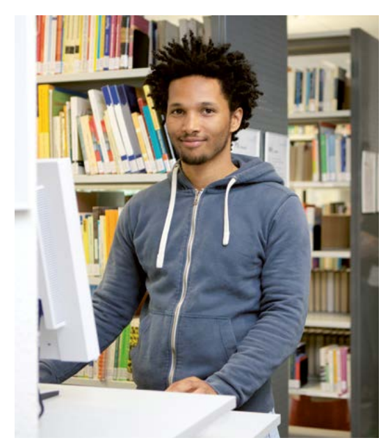
Academic qualifications to help professionals meet patient needs

Professionals with academic qualifications are the key to generating new knowledge in these sectors, developing innovative ideas, methods and structures, implementing them in day-to-day practice, and evaluating their success. Graduate professionals in these healthcare fields additionally have the capacity to support needs-based and economical resource planning in healthcare sector institutions such as hospitals, health centres, practices, and social care establishments catering to day and residential patients.