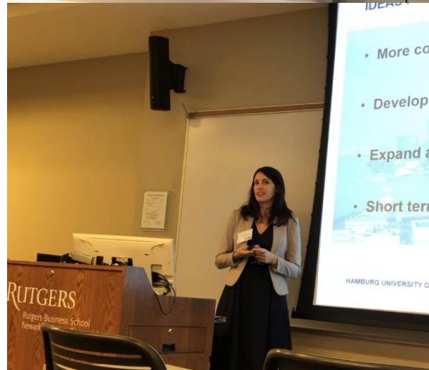
Academy of International Business US Northeast Regional Conference 2019 at Rutgers University in Newark, USA.